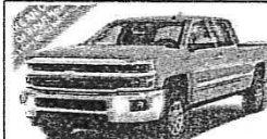
2017 Chevrolet Silverado 2500HD $66,760