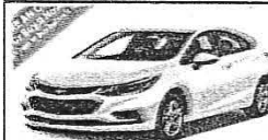
2017 Chevrolet Cruze $23,945